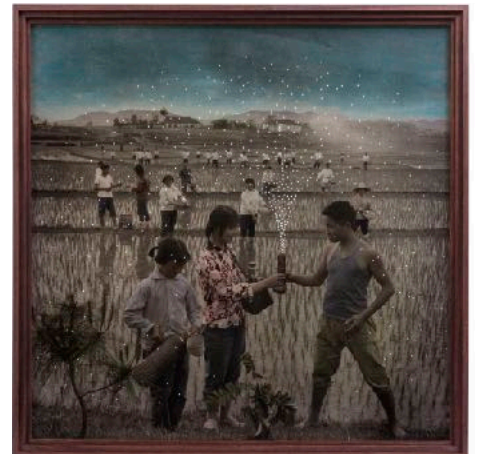
Cai Dongdong: Spring sowing, 2019, Silver gelatin print, collage, watercolour, lightbox, 40.5x40.5cm

Cai Dongdong , through techniques like scaling, magnifying, altering, modifying, and collage, alters the structure of photographs, disrupting the order in the original images, thus reshaping our perception of the images. His work prompts the audience to reflect on the content and the ways photographs are composed and expressed.