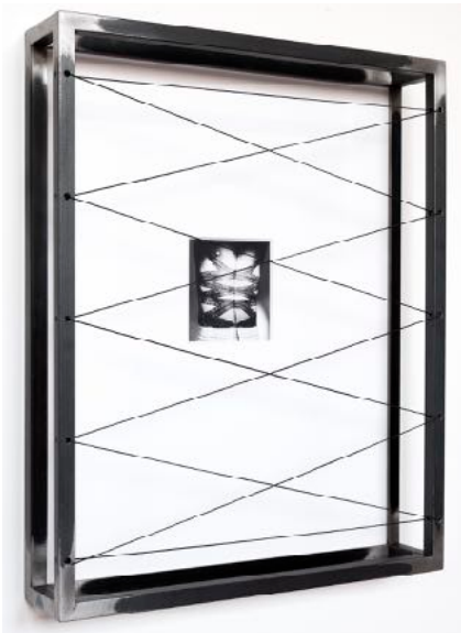
Lucas Foletto Celinski: Cross-Tied 5, 2016, Black and white photograph / hand printed on baryta-paper, steel frame, cotton cord, 50 x 40 x 8,5 cm

that is often imperceptible to the naked eye, conveying deeper messages that go beyond the actual image subjects. They encourage viewers to start from the images, delve deep into them, and ultimately break free from the confines of the image to explore profound intellectual and emotional resonances.