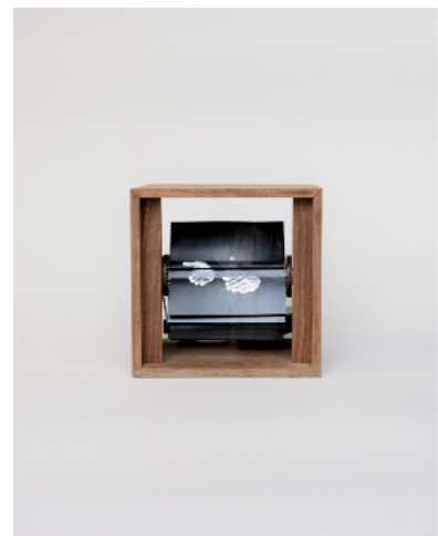
Ana Zibelnik: Timepiece, 2019, Motorized Flipbook, 17 x 17 cm