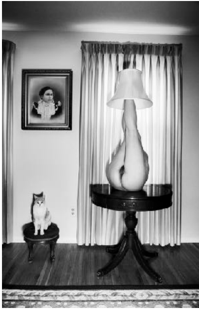
Loreal Prystaj: Lampshade, picture frame, and my pussy-cat, 2020, Fine Art Print on Baryta paper mounted on dibond, framed 100 x 65 cm

body of work, making his works a game of meaning that is free and boundless. The audience can freely participate and enjoy this game of meaning according to their own understanding and interpretation, transcending the confines and limits of the work.