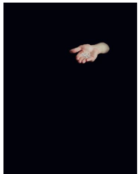
Michal Martychowiec: What remains the poets provide, 2018, chromogenic print 130x100 cm

Michal Martychowiec 's conceptual photography explores the extended meanings between images and symbols. In his work, images complement and converse with social narratives and historical narratives, sometimes even subverting each other. A typical example is his work "What Remains the Poets Provide", which presents a clear direction, but its true value and meaning need to be interpreted and determined through specific symbols. The symbols, among others, can be found in his preceding but also future works and the means to read it are offered throughout his